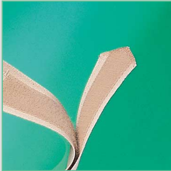
straps with Velcro® fastener

To finish the corset we offer the following: